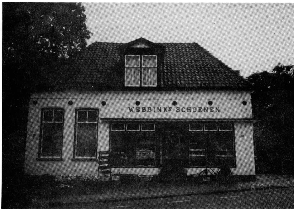
The Webbinks are alive and well in the Netherlands today. This is a Webbink Shoe Store in Vriezenveen.