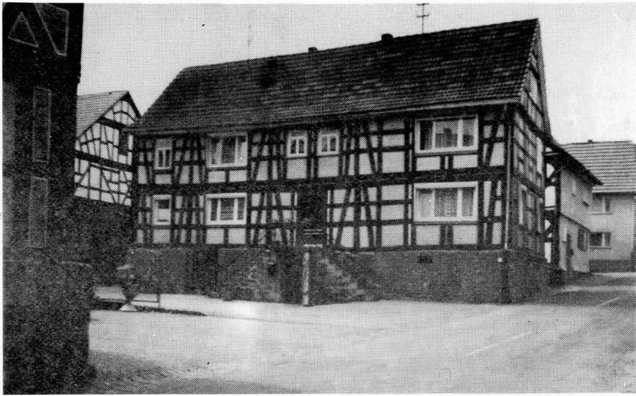
The Bunding house in Nieder-Gemunden